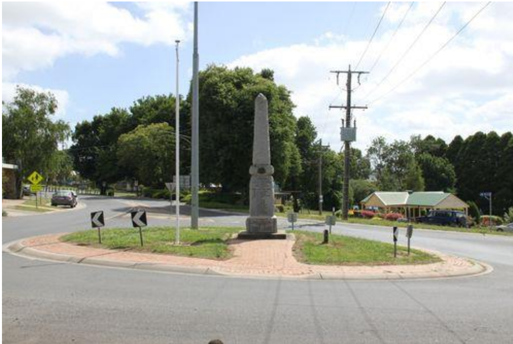
Neerim South War Memorial