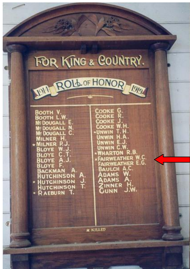
Crossover State School Honour Roll