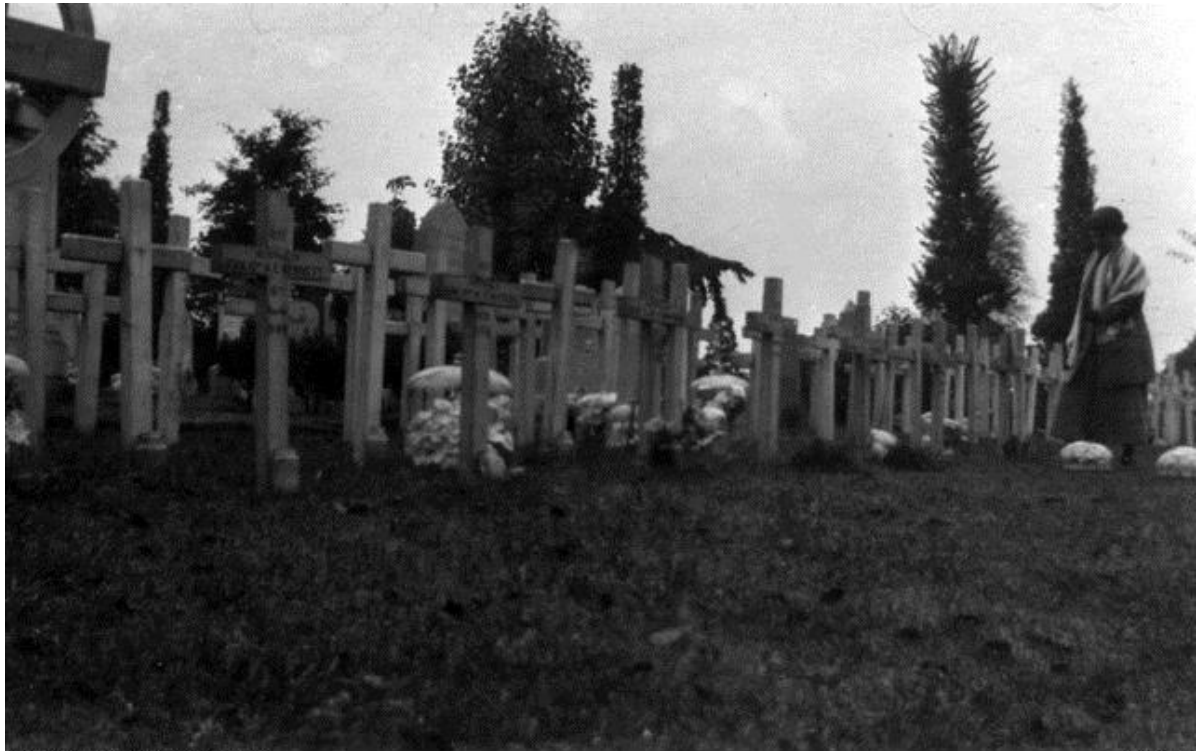
AUSTRALIAN WAR MEMORIAL